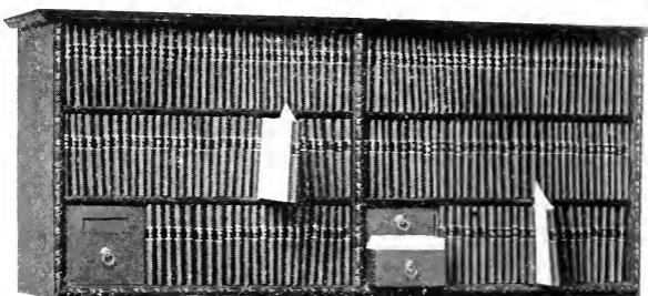
No. 210 Desk Top Cabinet

This Desk Top Cabinet contains 180 files, each file being 6 inches high, \frac{1}{2} inch wide, and 11\frac{1}{2} inches long. Note that this cabinet is over three times as large as cabinet No. 60. It contains a special card index and storage box, but if one desires to dispense with this storage box, we will give ten more files instead. The card index contains 200 blank cards and guide cards of the alphabet. This cabinet is standard for the business man, and the most popular seller we have. We can make immediate shipments. The cabinet is put together by expert cabinet makers and the wood used is the finest quartered oak, golden oak finish.